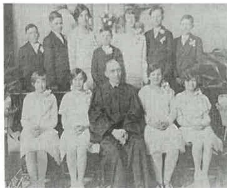
In honor of our Confirmation Class of 2021, pictured above is our first class, in 1929!